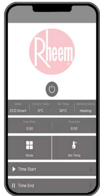
Rheem SEA Mobile Application

Receive real-time notifications on your phone whenever your water heater power status has changed