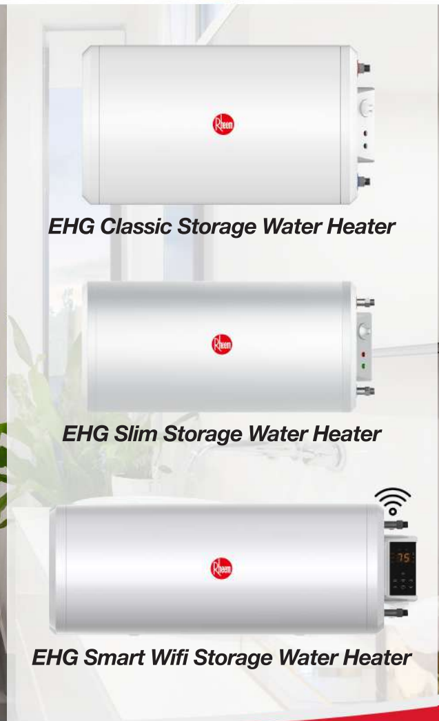
EHG Classic Storage Water Heater